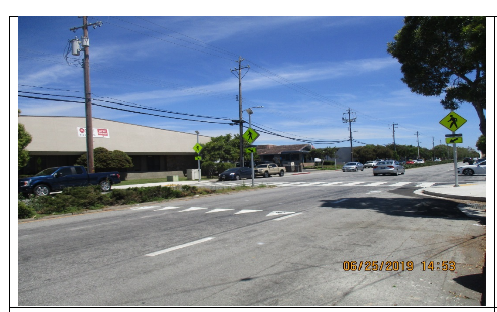
DOOLITTLE DR. AT BERMUDA AVE.