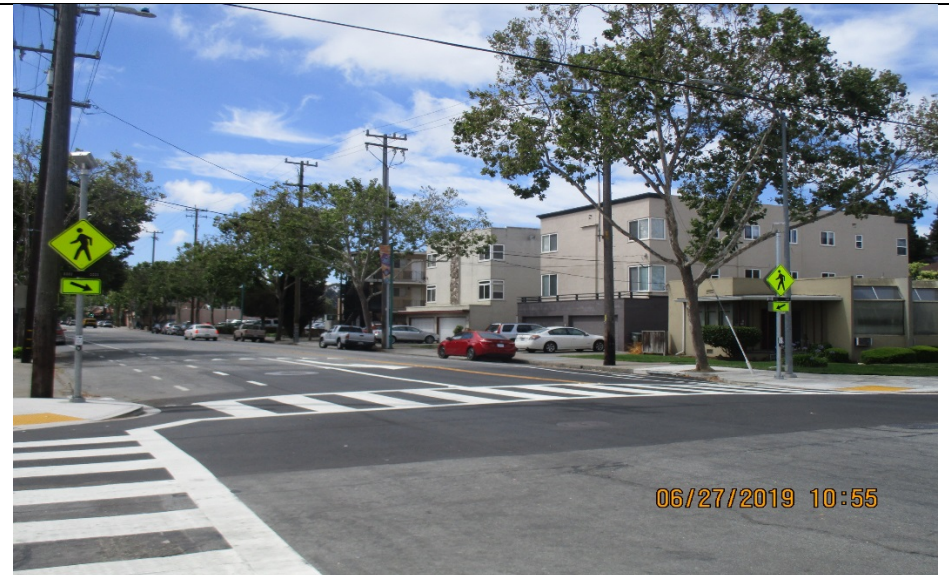
BANCROFT AVE. AT DOWLING BLVD.